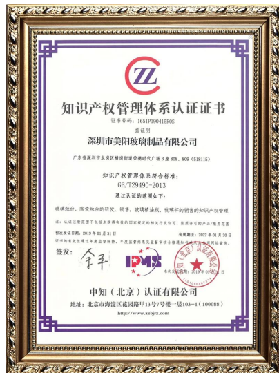
Enterprise Intellectual Property Patent No.:201630655323.4