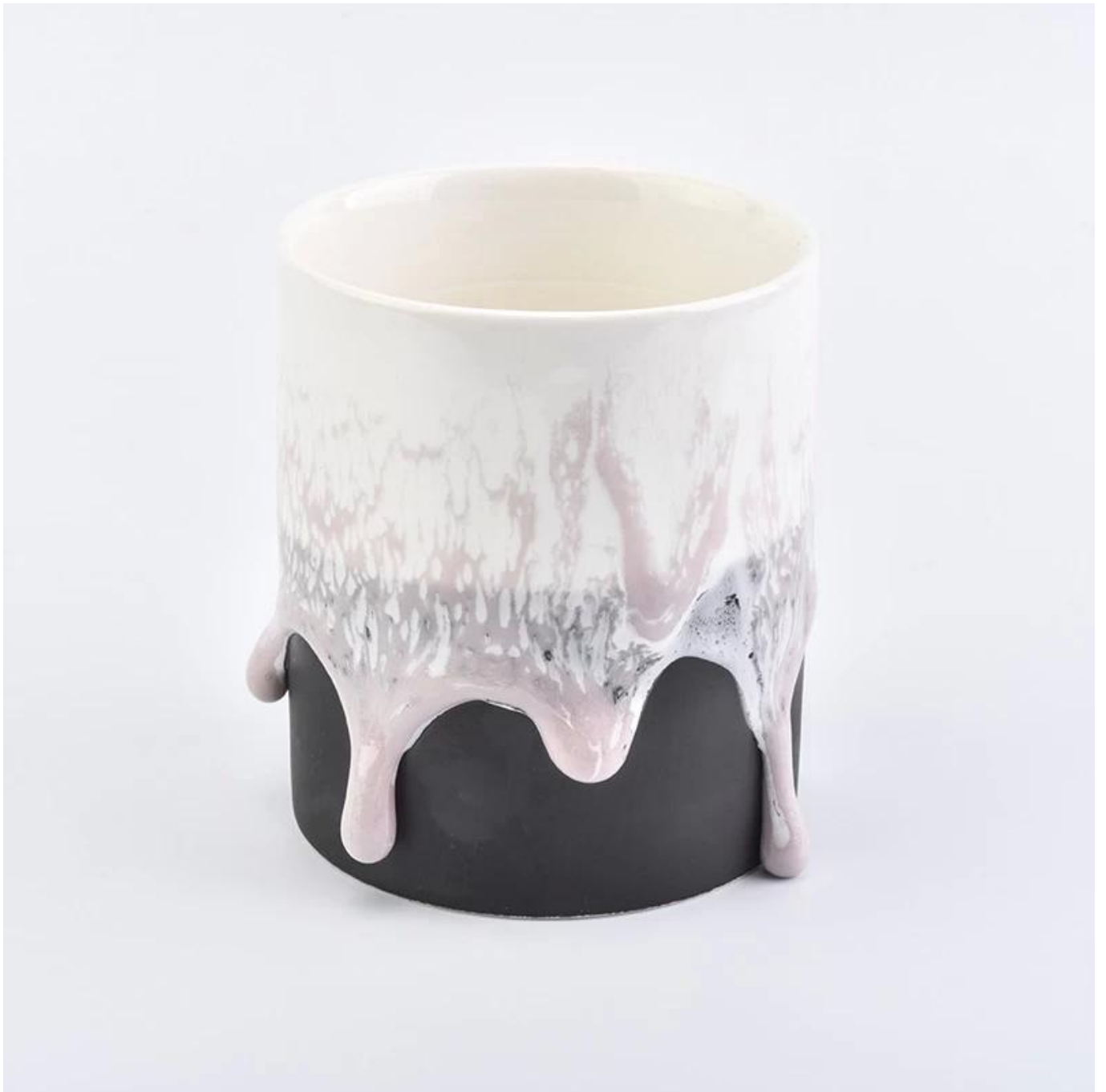
Candle lids accessories: