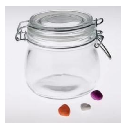
Customized glass storage