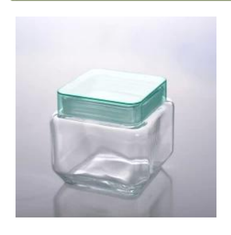
Airtight food jar