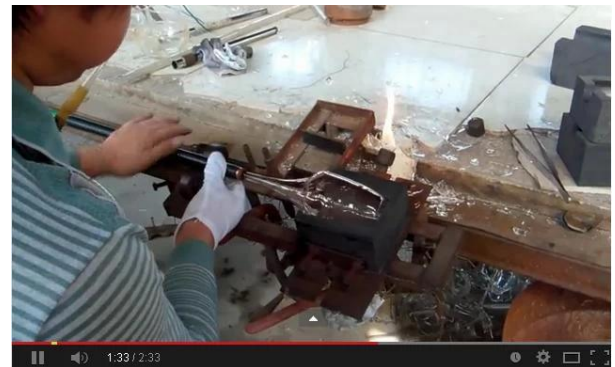
Hand Blown Method