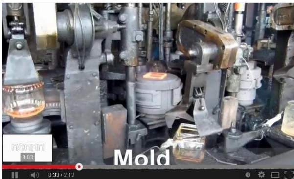
IS Machine Method