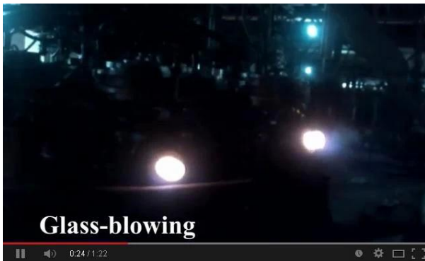
Machine Blown Method