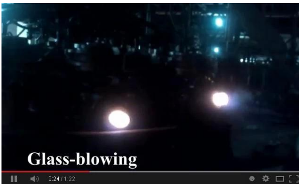
Machine blowing technology

Hereby watch our production line video online, welcome to visit us on site.