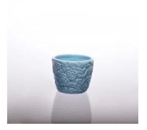
Special ceramic candle holder