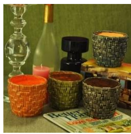
Color glaze ceramic candle holder