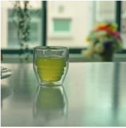
Pyrex coffee cup