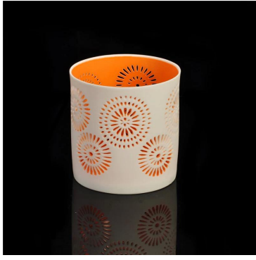
Colored Christmas Hollow Ceramic Votive Candle Holder