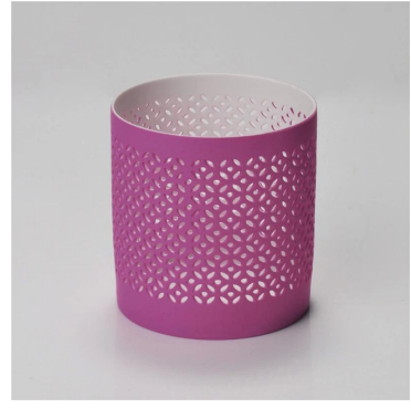
Christmas decorative hand made colored hollow ceramic candle jar