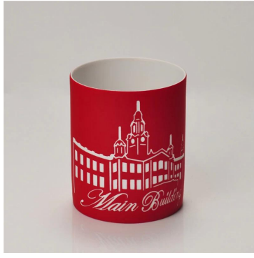
Wholesale Colored Christmas Hollow Ceramic Candle Jar