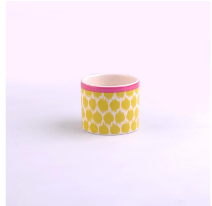
colorful painting ceramic candle holders