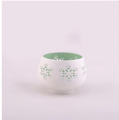
hand made ceramic candle holder