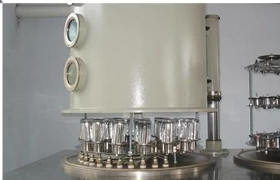
04 VACUUM ELECTROPLATING