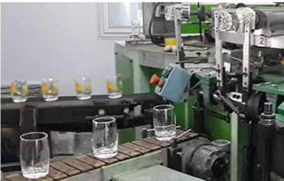
05 SCREEN PRINTING