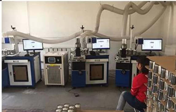
02 LASER ENGRAVING