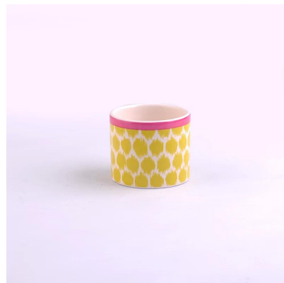
colorful painting ceramic candle holders