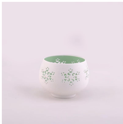
hand made ceramic candle holder