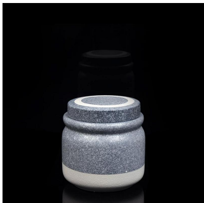
Ceramic candle holder with marble finish