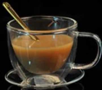
Double Wall Glass