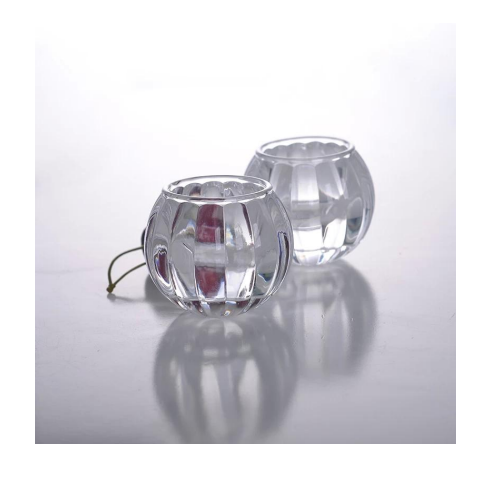
wedding candle holder