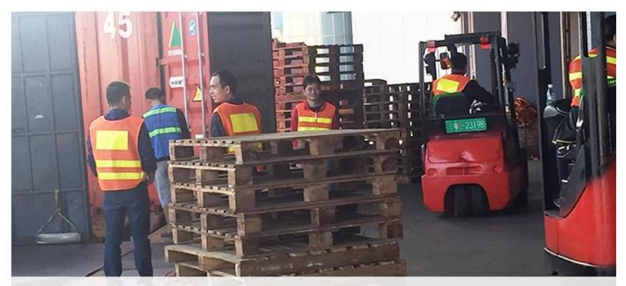
Own professional shipping company( Shenzhen Sunny Worldwide logistics)