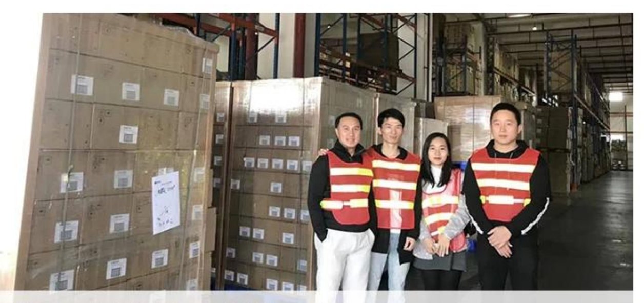
20+ years freight history and WCA members.