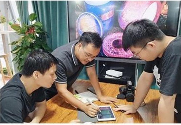
Award-winning Design Team won the trust of many upscale brands