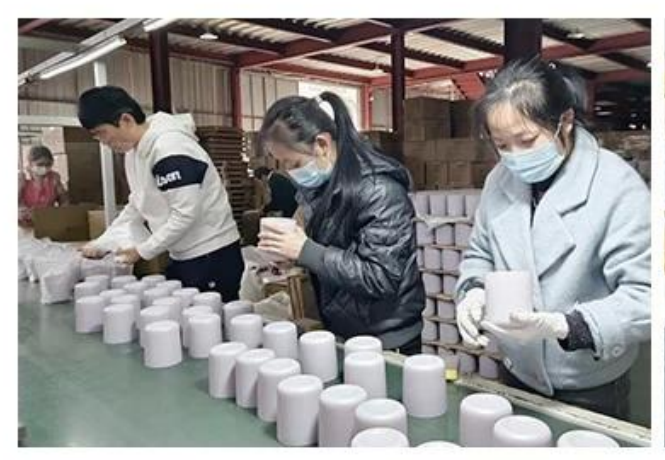
QC Extra Six Steps No major quality complaints for 9 years