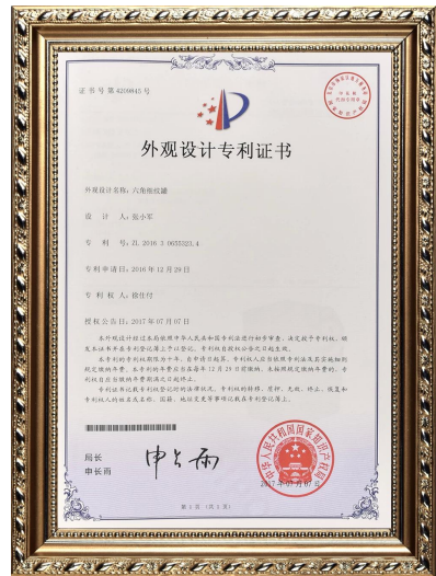
Patent number: 201630655323.4