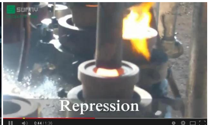
Mechanical press technology