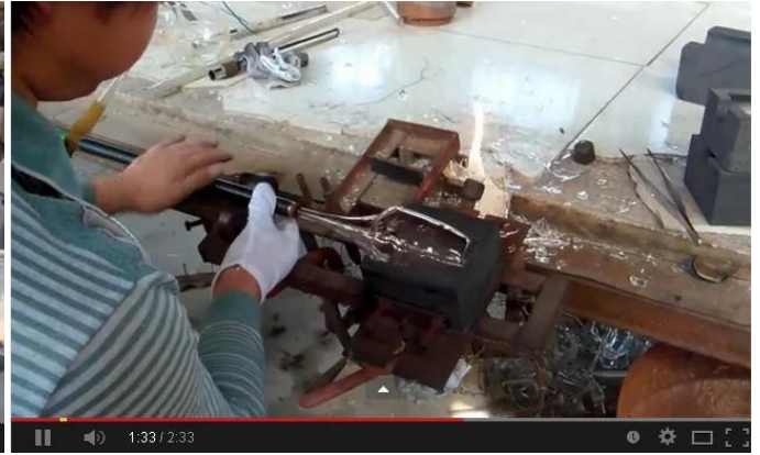
Hand blowing technique