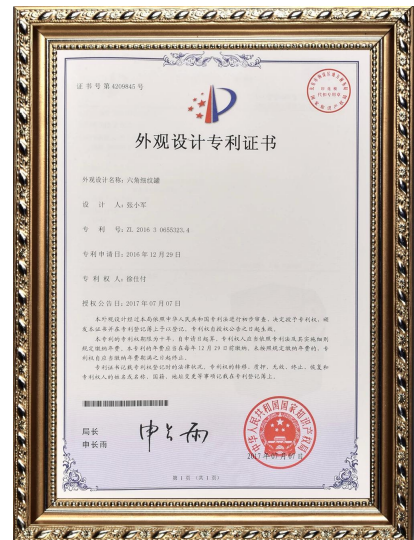
Patent n. 2.01630655323.4