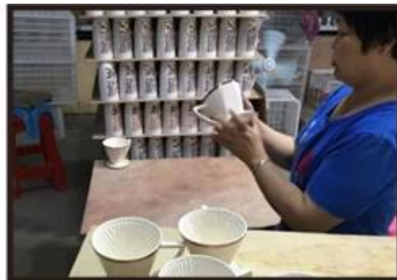
Inspection the decal product