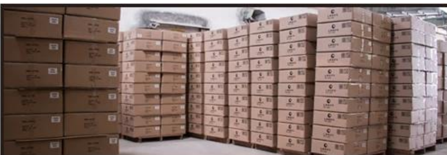
Ready to loading