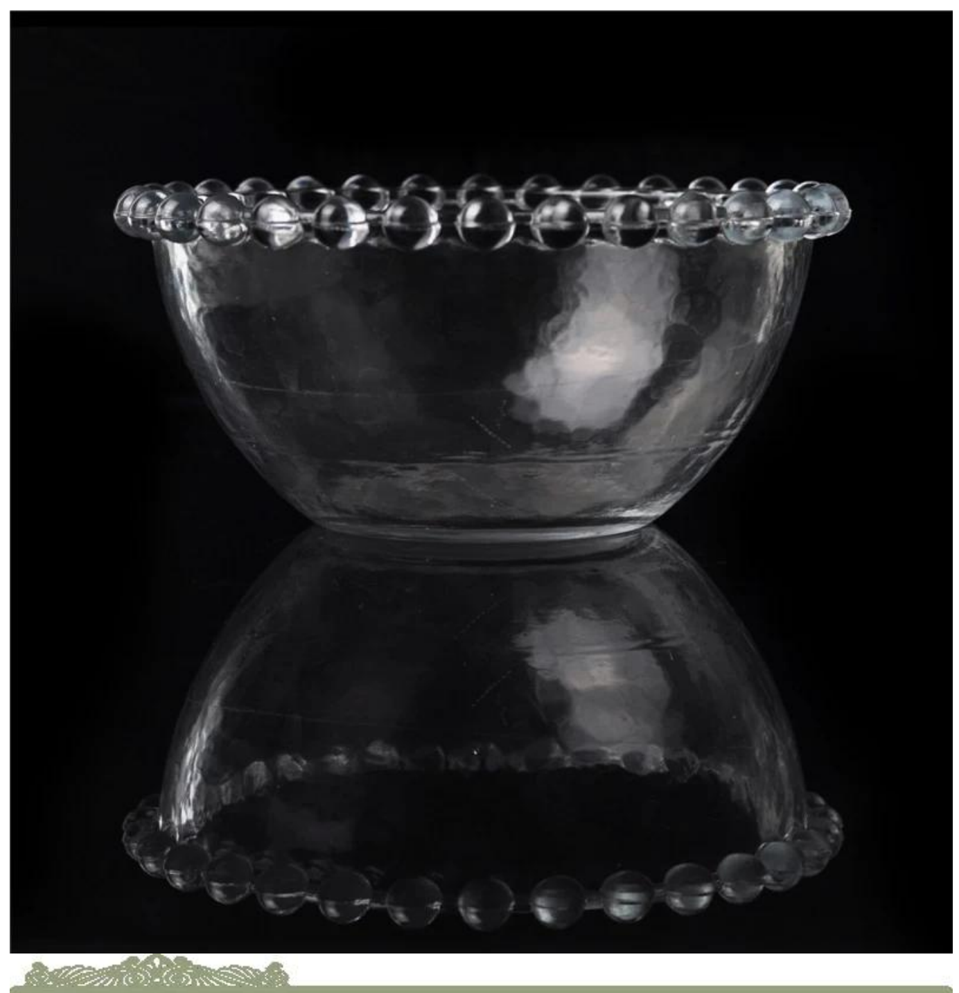
Similar Products Link