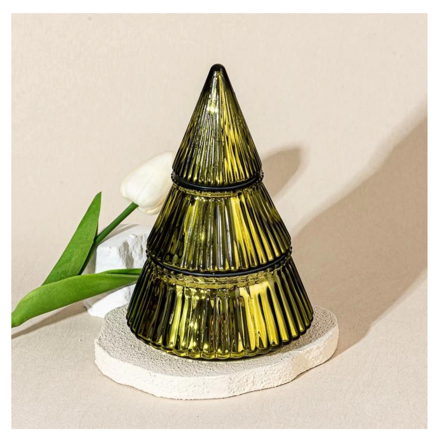
Elegant and durable, our Christmas Tree Style <u>glass candle holders</u> are ideal for bulk event decor, weddings, and retail resale. Classic striped design adds a modern touch to any setting.