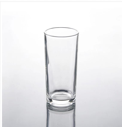
High transparent glass