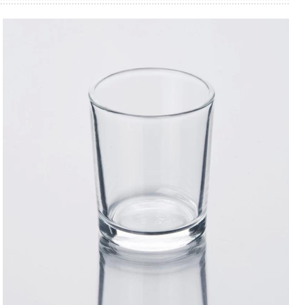
Transparent glass child