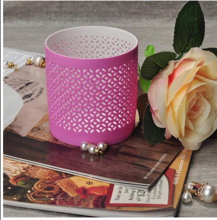
Lovely Pink Heat Resistant Hollow Ceramic Candle Jar