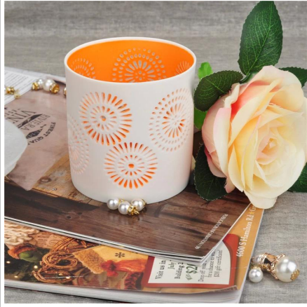
Ceramic Candle Jar Wholesale Painted Interior