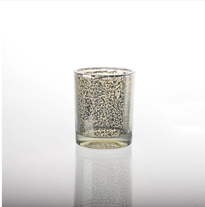
Sprayed candle holder