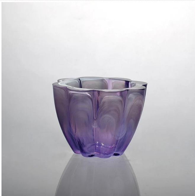
Color painting candle holder