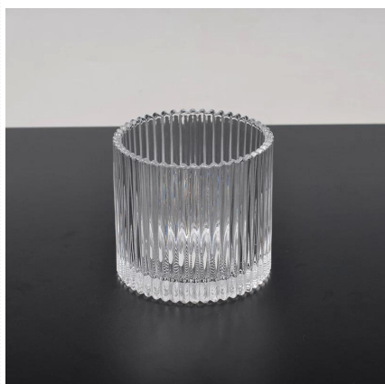
clear glass candle holder