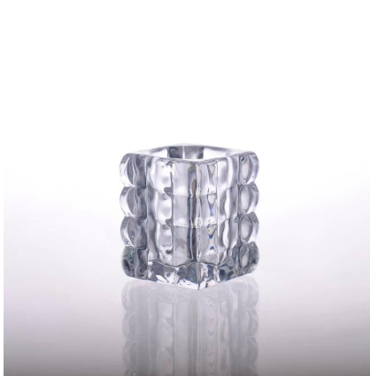
Square glass candle holder