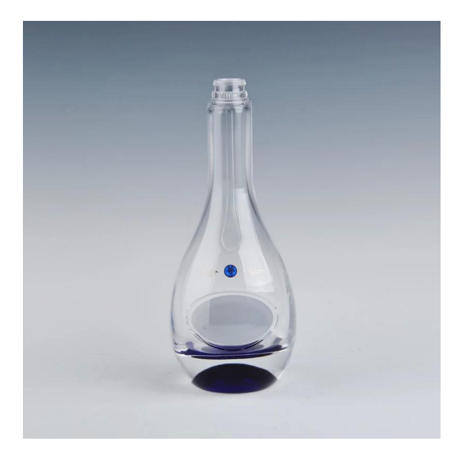
special shape glass wine bottle