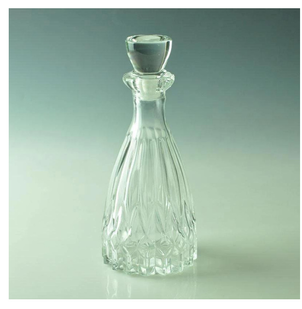
engraving glass wine bottle