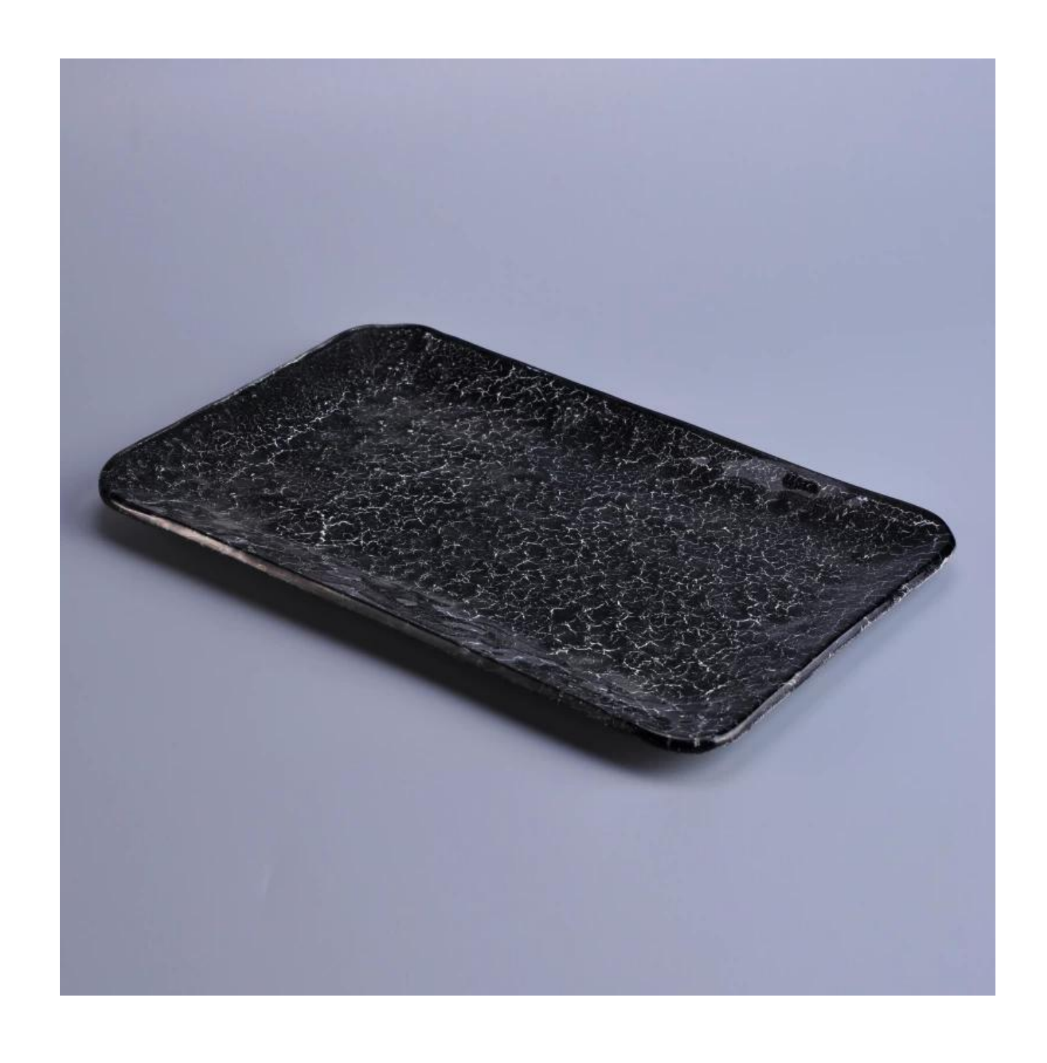
Multiple Design For Your Choice