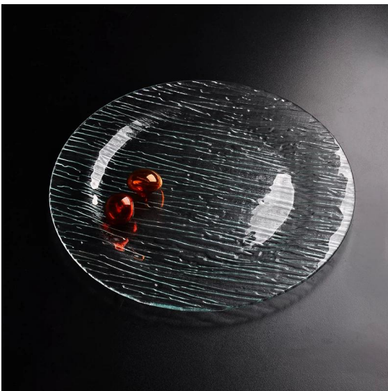
round clear glass plate