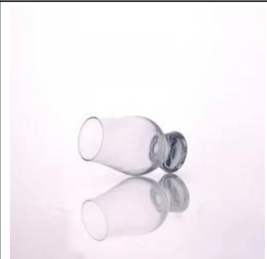
stemware beer glass