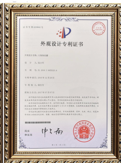
Patent no.: 201630655323.4