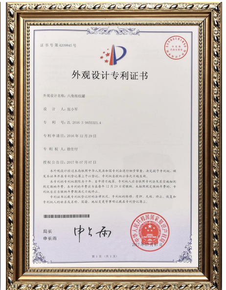
Patent Number: 201630655323.4