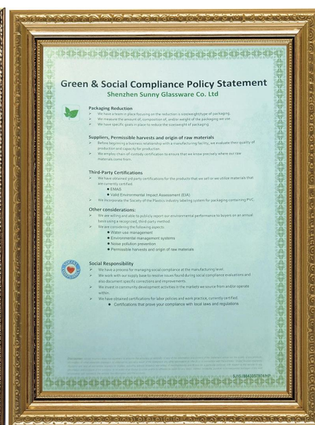
Green and social responsibility Policy's statement