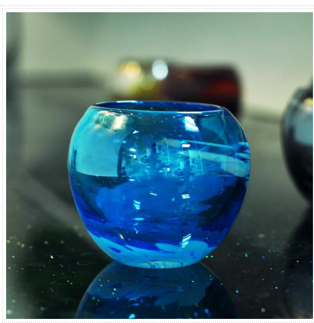
handmade candle holder