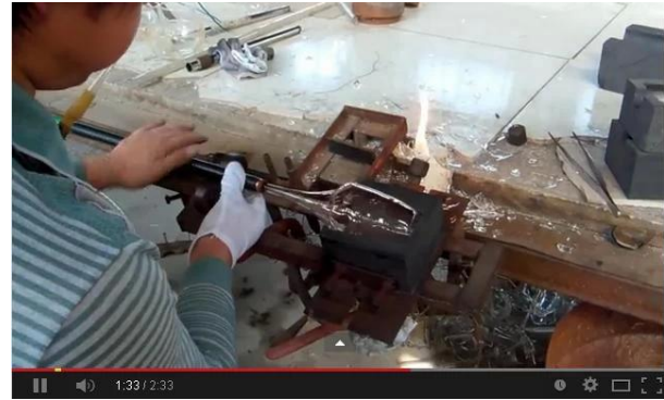
IS machine technology