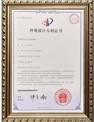
Patent number: 201630655323.4