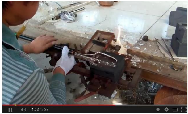
Hand blowing technique