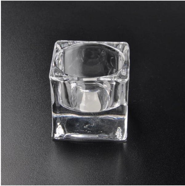
glass candle holder