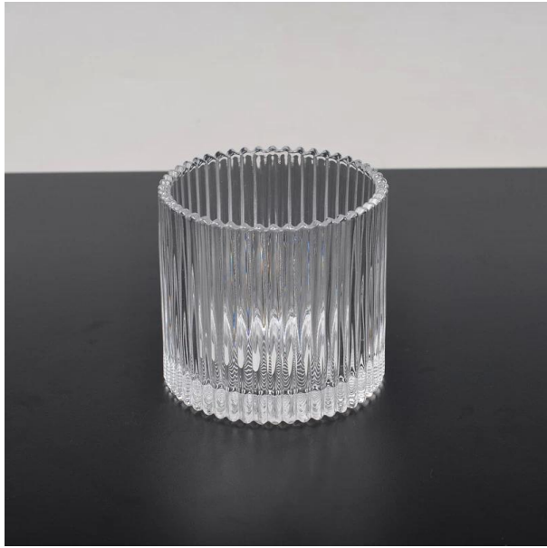
glass candle jar