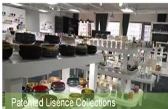
Patented Lisenice Collections