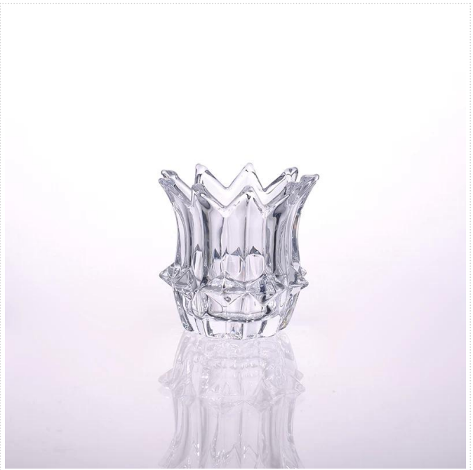
special glass candle holder cup