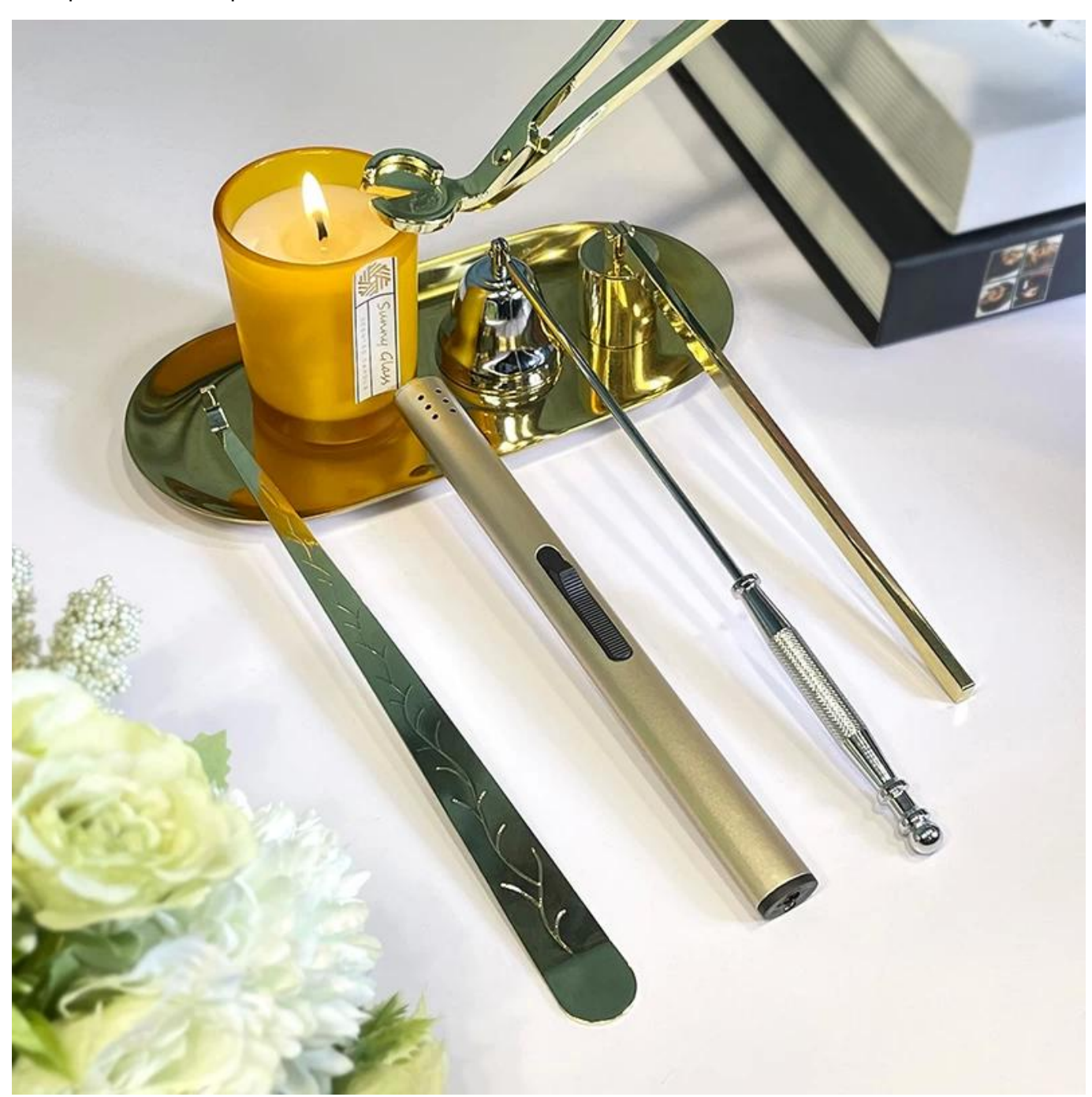
Why choose Sunny.

Sunny Glasswares not only places \mathsf{OEM} / \mathsf{ODM} orders, but also helps many brands to start with product concepts.