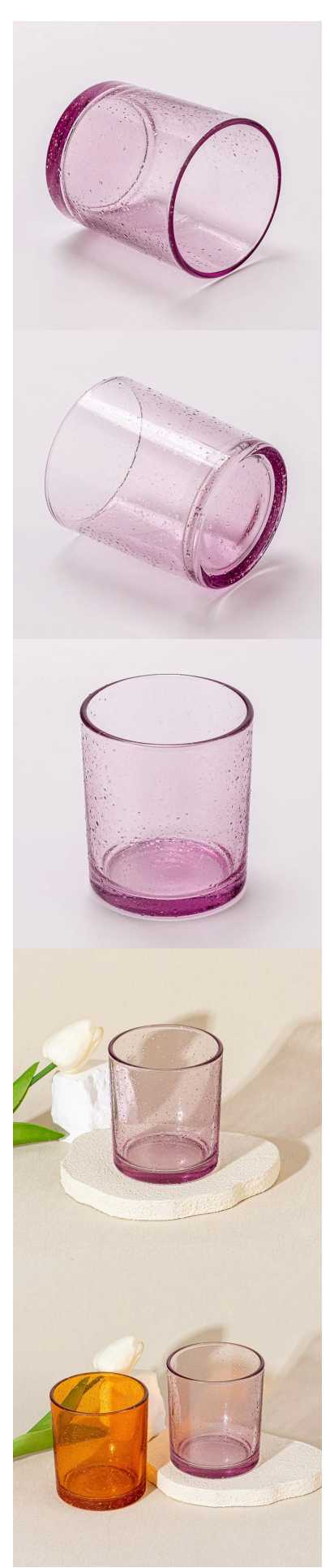
Application: Decorative dinner in the bar or bar . Suitable for families, hotels or gardens . Special lover gift . Any chance of decoration