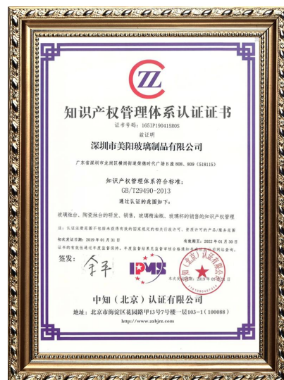
Enterprise Intellectual Property Patent No.:201630655323.4