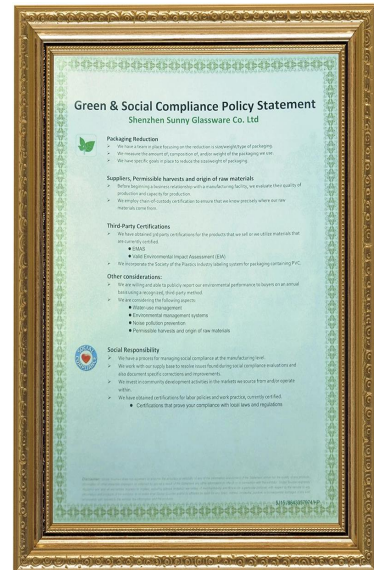
Green and social compliance Statement by Polidy