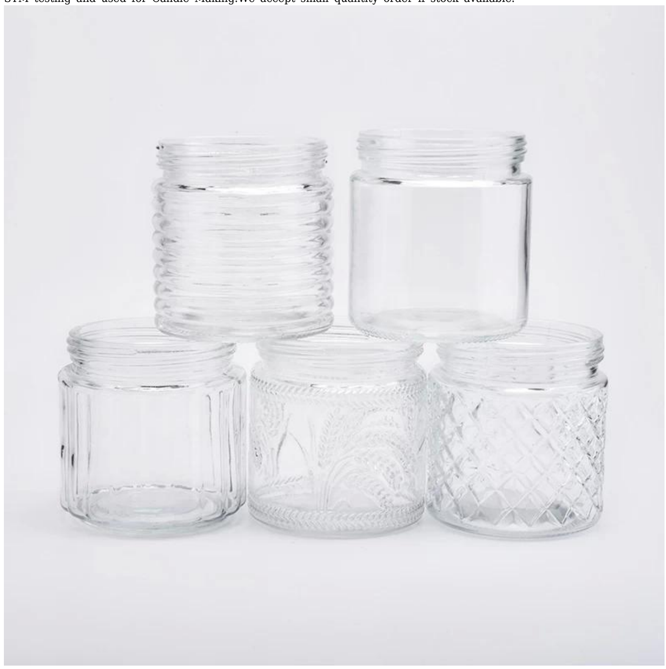
Why choose Sunny Design Candle Holders

Except for the named pattern and pattern listed as following, Sunny Glassware is capable to do any customized designs. Our award wining designers are also able to optimize your ideas to co me out creative fragrance products that suite your local market. This Glass Jar is machine made from sodalime glass in high quality. It can not only used as storage jar in Kitchenware, but also able to pass A STM testing and used for Candle Making. We accept small quantity order if stock available.