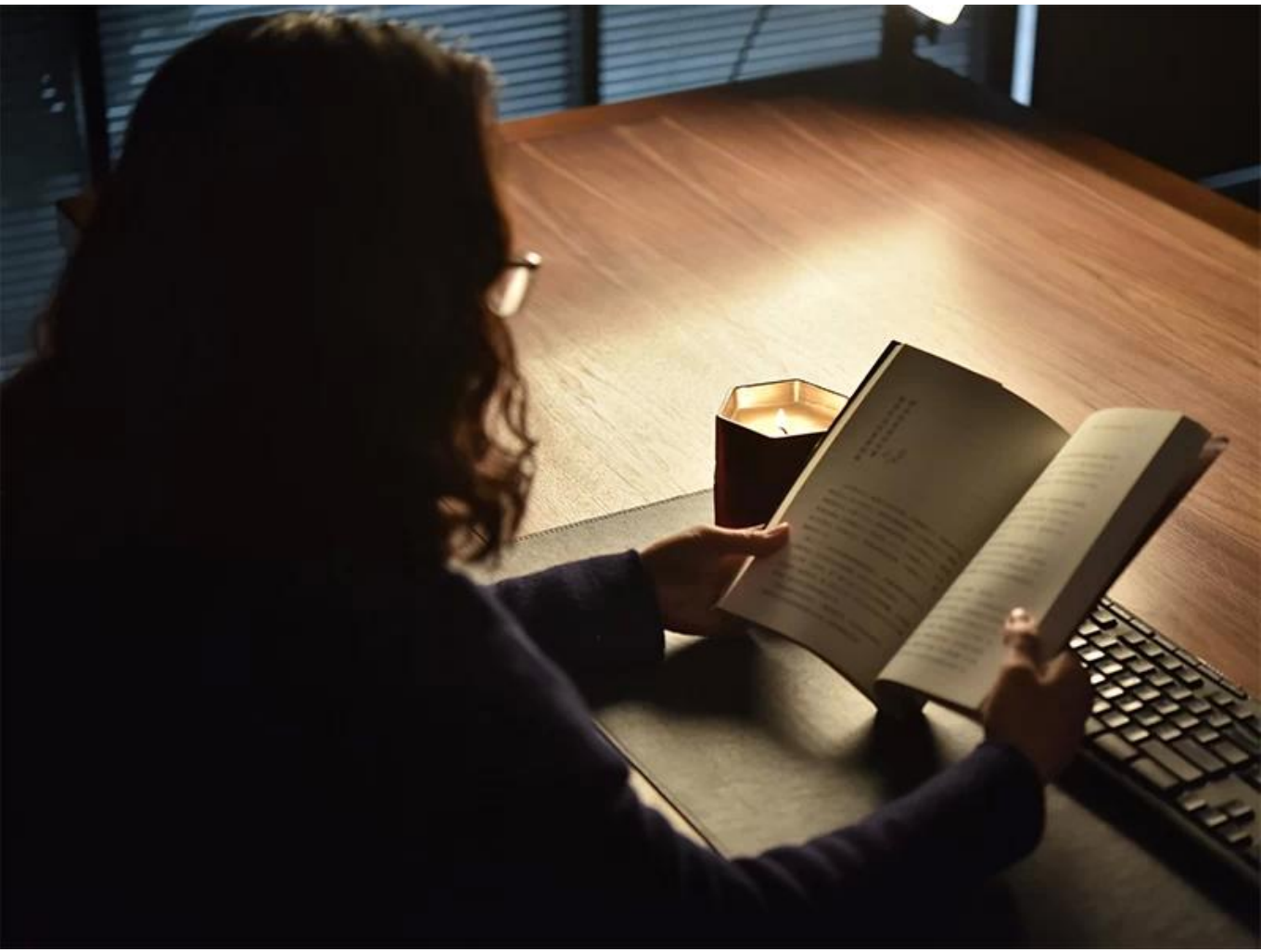
Sunny Brand Story