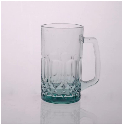
18oz glass beer mug