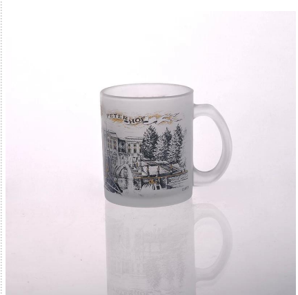
glass milk cup with picture