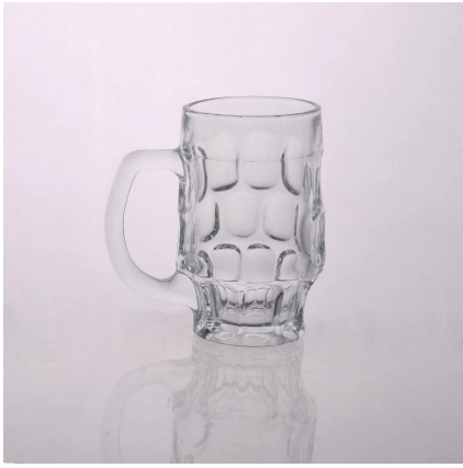
embossed beer mug