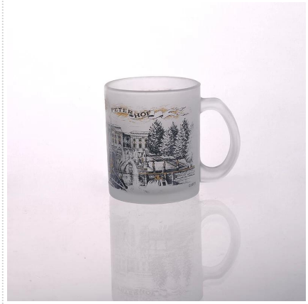
glass milk cup with picture