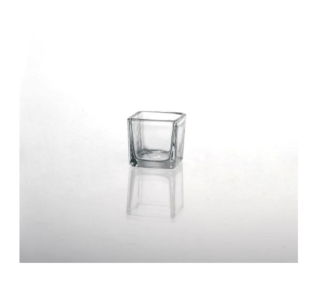
square clear glass candle holder