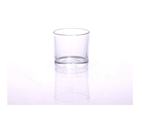
<u>machine made glass candle</u> <u>holder</u>