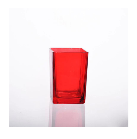
spray color glass candle holder