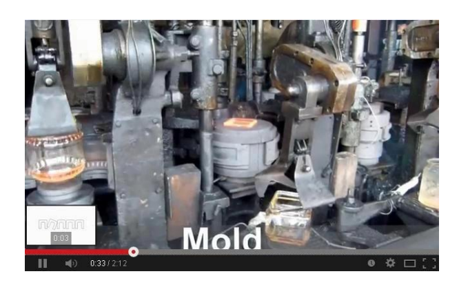
IS Machine Method