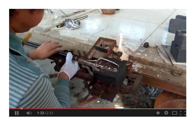
Hand Blown Method