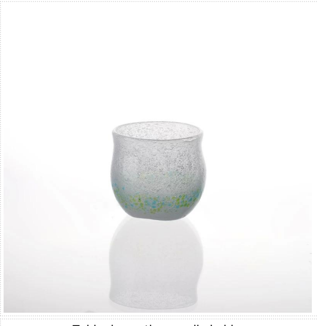
Table decoration candle holder