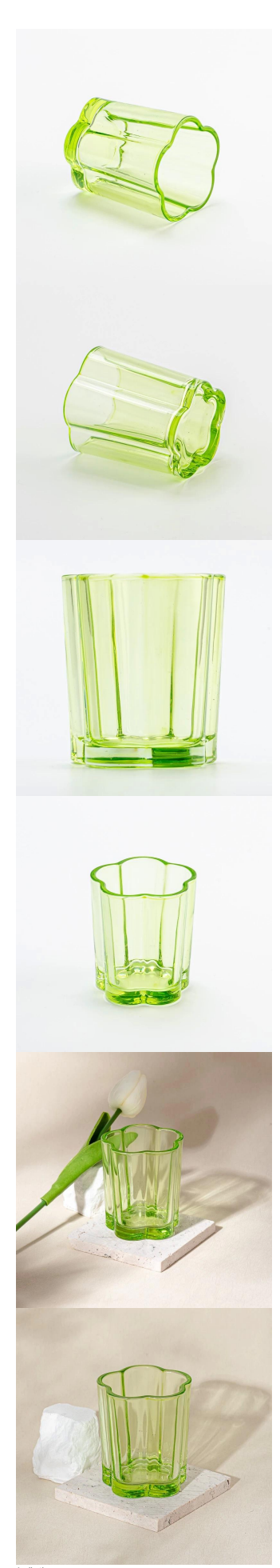
Application: Decorative dinner in the bar or bar . Suitable for families, hotels or gardens . Special lover gift . Any chance of decoration