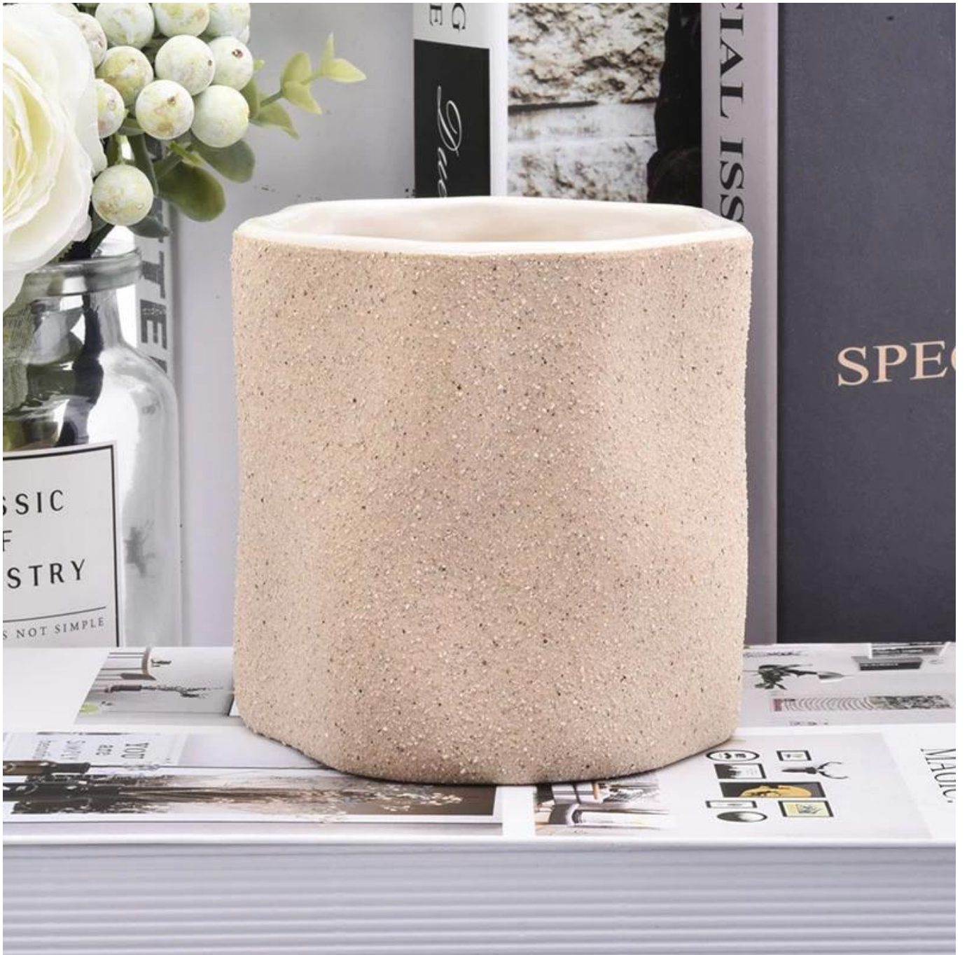
Packing & Shipping