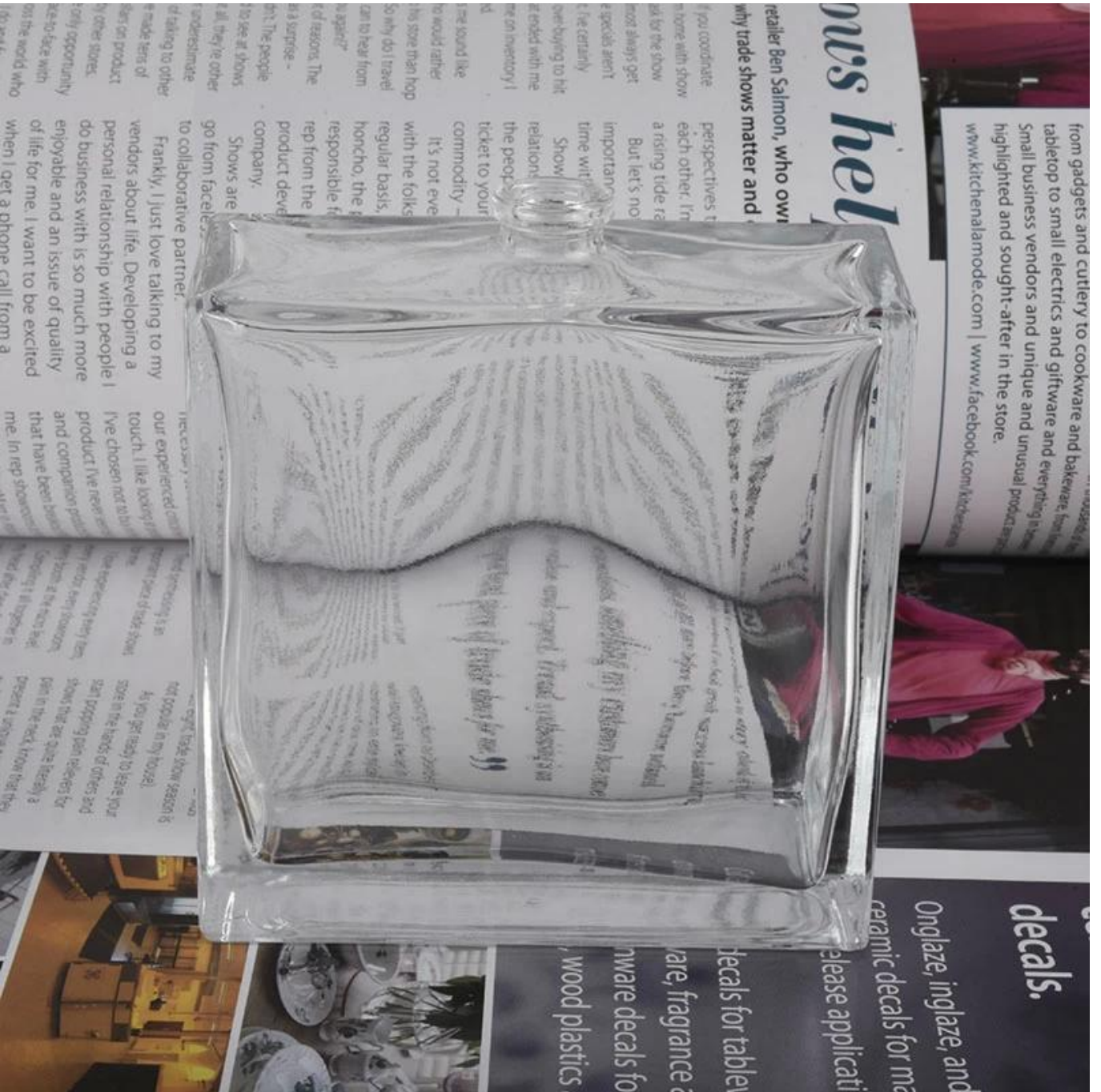
Packaging & shipment